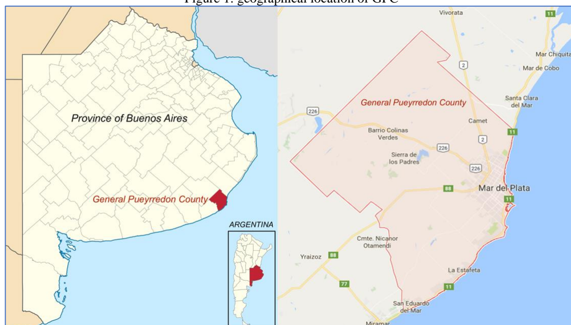
Figure 1: geographical location of GPC